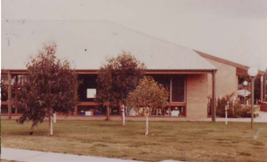
Stawell Library—1980 and now.

Stawell is celebrating the 30th birthday of their library which was purpose built on the corner of Patrick St. and Sloane St. in 1980. They are having a "Birthday Bash" on Sunday 14th March from 3.00 pm. There will be Children's craft activities, face painting, games, a chocolate treasure hunt, sausage sizzle and spiders. Afternoon tea, and birthday cake will be served from 3.30 pm. Come along and join in the fun.